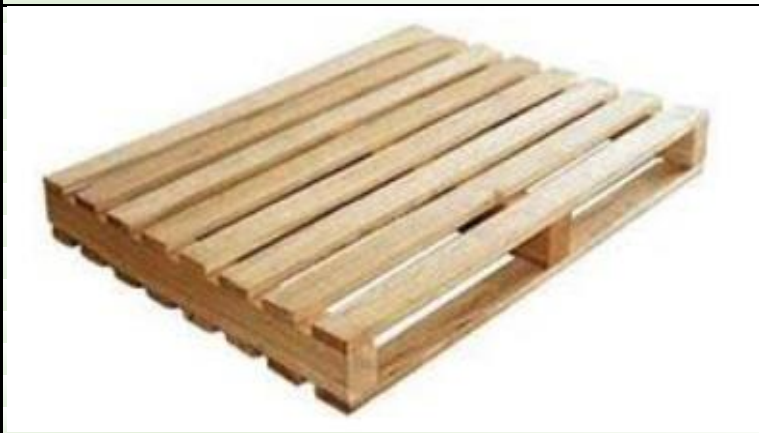
Example: 2 Way pallet.